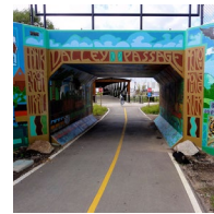
Urban Ecology Center