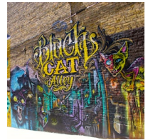
Hank Aaron Trail

Ep. 1: The County Grounds, Wauwatosa – The site of Milwaukee's first hospital for the care and treatment of persons with mental health concerns, originally known as the Milwaukee County Asylum for the Insane, it is in danger of being parceled off for development which would not only destroy one of the last vestiges of natural landscape in the area, but also the habitats of several native species.