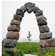
Black Cat Alley